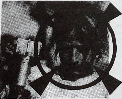
Young Kurdish girl holds remains of rocket, fired at her village by the Turkish army. Turkey, a known human rights abuser have been a British Government invited guest at the Royal Navy & British Army Equipment Exhibition...

The British Government targeting oppressive regimes around the world